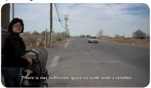
The 2nd Street HIA in Bernalillo County, New Mexico used video to communicate their findings. ix

6. Illustrate the impact through stories, supported by strategic use of data.